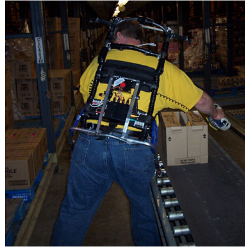
Figure 1. Moment monitor on subject.

To quantitatively document the functional status of the low back, workers were asked to participate in kinematic back functional assessments. This required workers to interact with a computer while wearing a clinical lumbar motion monitor (LMM) to document kinematic performance in three-dimensional space using the assessment protocol described previously in the literature (Ferguson & Marras, 2004). This low-back functional assessment required approximately 10 minutes. This procedure yields objective data (sagittal range of motion, velocity, and acceleration) describing the worker's back kinematic function and represents an independent, performance-based, low-back assessment. The model underlying this analysis has excellent sensitivity (90%) and specificity (92%) in its ability to correctly differentiate those with and without back pain (Marras et al., 1995; Marras et al., 1999). By comparing each employee's kinematic profile with that of a normative database, the model was able to quantify how that worker's kinematic function compares to that which would be expected of a person of that age and gender (expected normal kinematic function). The worker's kinematic back function is scaled relative to the expected normal kinematic function (for an individual) and is defined as the probability of normal or p(n) . A probability of less than 0.5 indicates impaired function for an individual's age and gender,